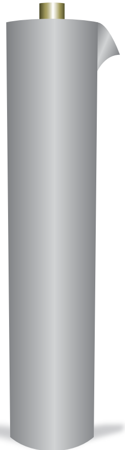
6' X 45' ROLL