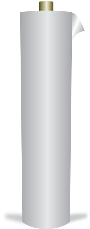
6' X 60' ROLL 1.83 LM X 18.3 LM