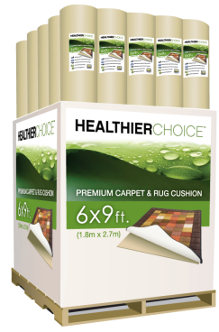
POP Box Display